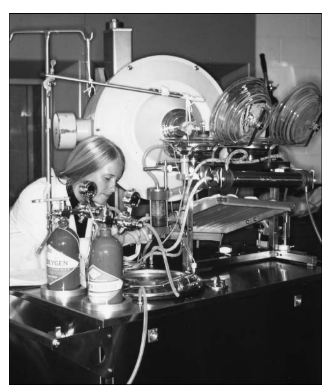
FIGURE 1. A research study of a dog kidney being perfused on a Belzer perfusion pump and imaged with the pinhole collimator.

In 1968, Ranos Rado, MD, had introduced diuretic renography in nuclear medicine. (16). We began to use the technique with the gamma camera in the late 1970s but soon found that many factors profoundly influenced the final results and interpretation of the study. We continually modified our technique to minimize those factors that we could control, such as hydration. For example, many babies presented for their studies with minimum liquid input as if they were undergoing an intravenous pyelogram. Their urine output was so minimal even with the diuretic response that false-positive responses misled interpretation. We eventually published an article that discussed the many factors that affected the diuretic renogram (17). Max Maizels, MD, a pediatric urologist and cofounder of the Society for Fetal Urology (SFU) expressed his concerns to me that diuretic renography was being performed with a variety of differing techniques at other institutions with