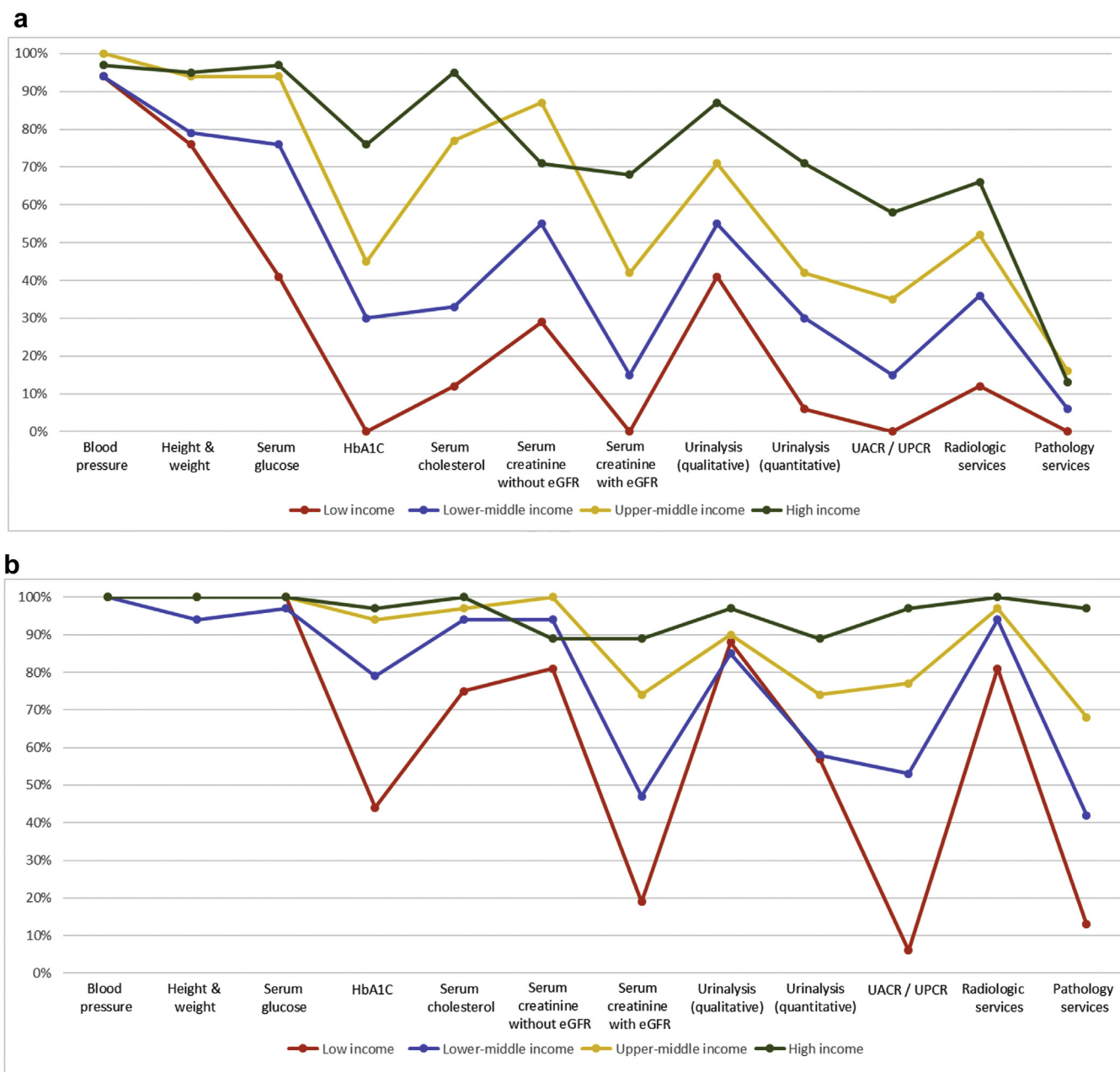
Figure 1 | Health care services for identification and management of chronic kidney disease by country income level. (a) Primary care (i.e., basic health facilities at community levels [e.g., clinics, dispensaries, and small local hospitals]). (b) Secondary/specialty care (i.e., health facilities at a level higher than primary care [e.g., clinics, hospitals, and academic centers]). eGFR, estimated glomerular filtration rate; HbA1C, glycated hemoglobin; UACR, urine albumin-to-creatinine ratio; UPCR, urine protein-to-creatinine ratio. Data from Bello et al. 4 and Htay et al. 42

low-income regions. For instance, more than 90% of upper-middle-income and high-income countries reported having chronic peritoneal dialysis services, whereas these services were available in 64% and 35% of low-income and lower-middle-income countries, respectively. In comparison, acute peritoneal dialysis had the lowest availability across all countries. More than 90% of upper-middle-income and high-income countries reported having kidney transplant services, with more